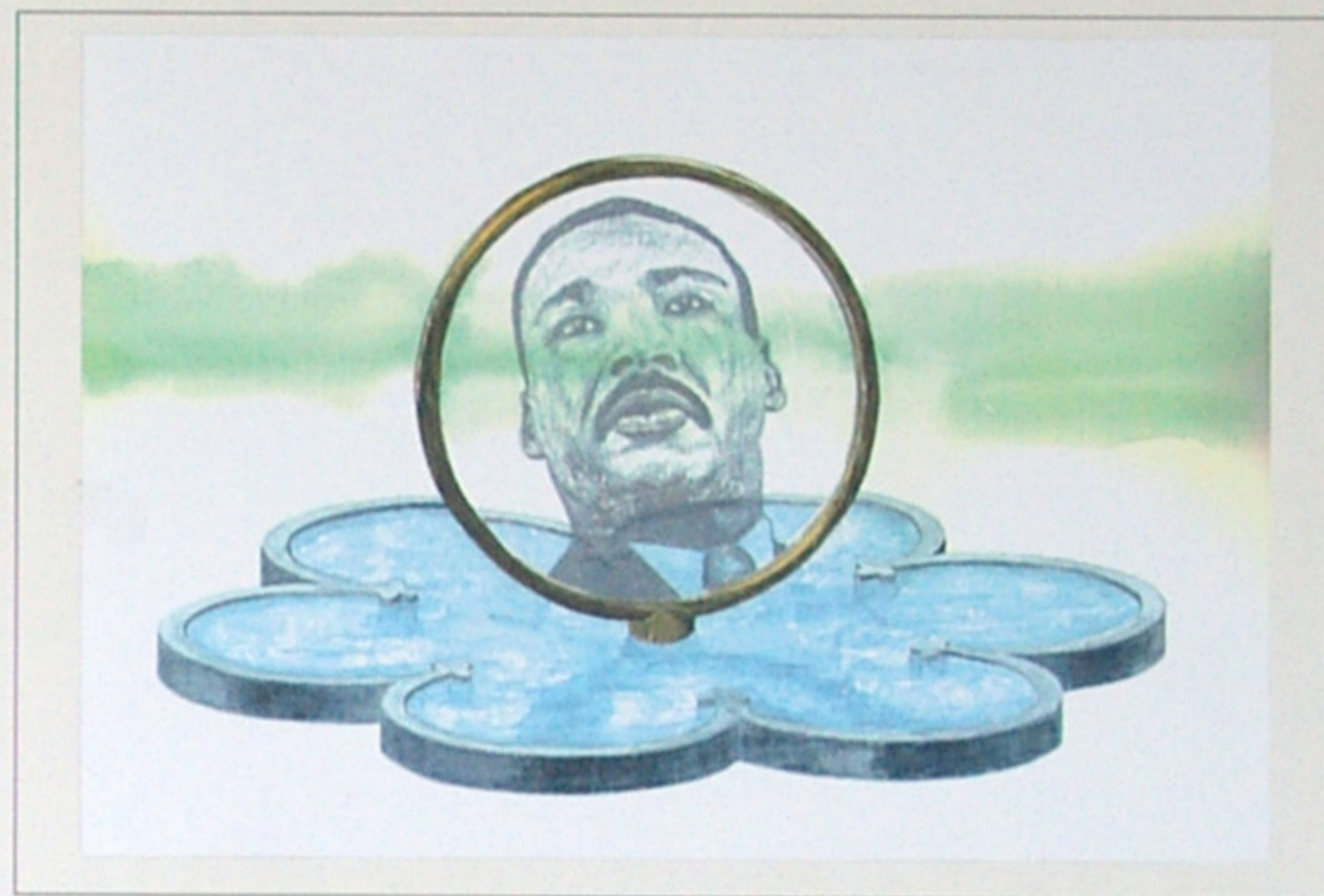
Etched Glass Dr. Martin Luther King, Jr. Monument